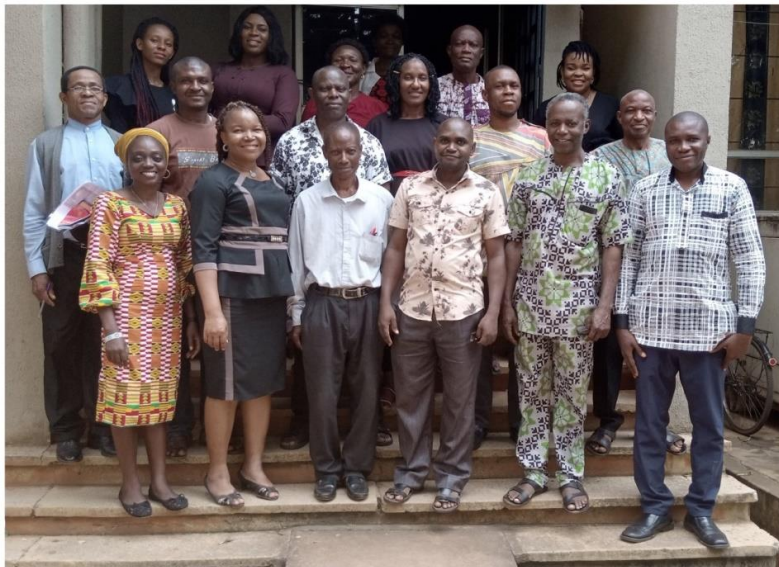
Resource Persons and Trainees