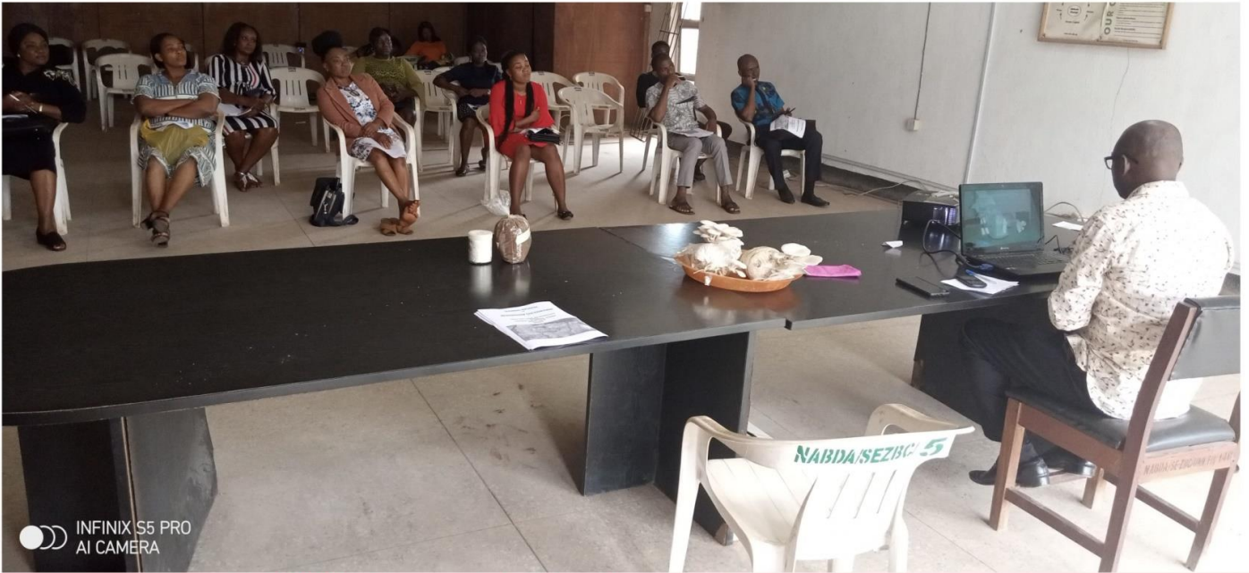
Edible Fungi (Mushroom) Treaining

Workshop is on-going at the center and the participation is quite encouraging